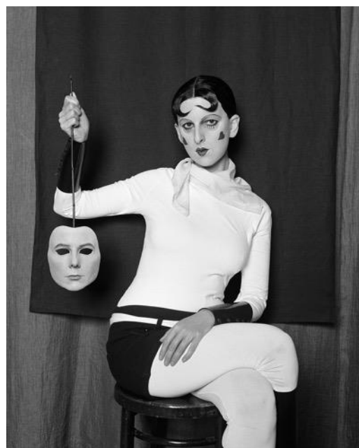
Gillian Wearing - Me as Claude Cahun Holding a Mask of My Face, 2012