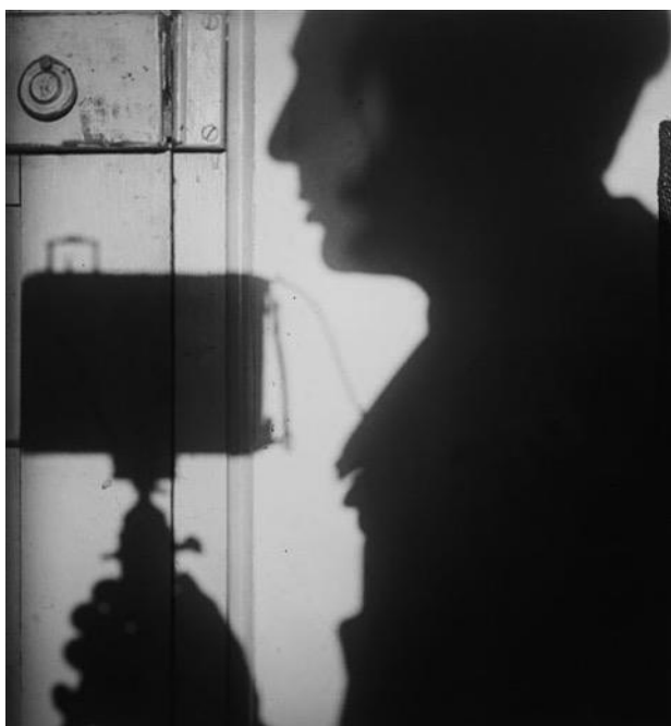
André Kertész - Self-portrait, Paris, 1927