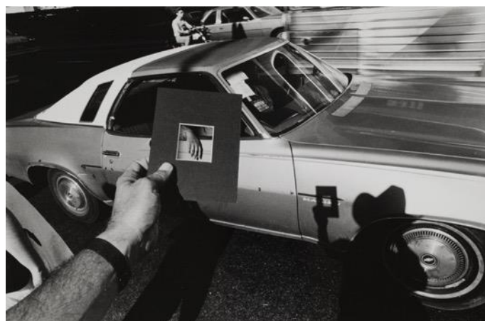
Kenneth Josephson - Chicago, 1980