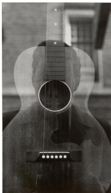
Ralph Eugene Meatyard - Untitled (Self-Portrait with Camera and Guitar), 1955