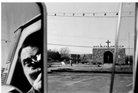
Lee Friedlander - Route 9W, New York, 1969