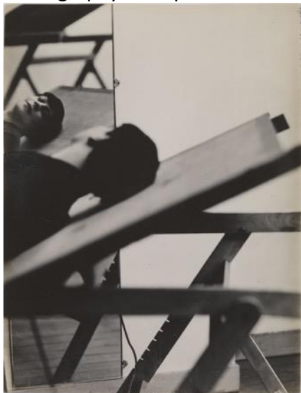
Florence Henri – Self-portrait in mirror, 1928