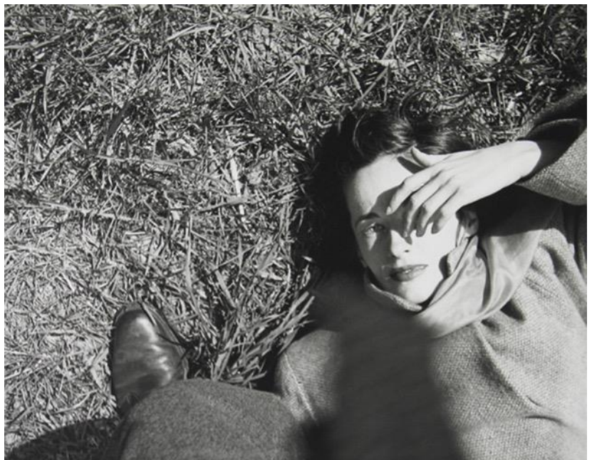
Saul Leiter - Sunday Morning, The Cloisters, 1947