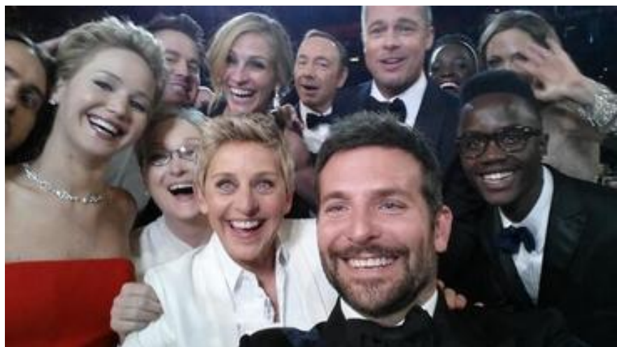
The most shared Selfie to date with over 3 million re-tweets

On 30 March 2017, the Saatchi Gallery in London launched an exhibition entitled From Selfie to Self-Expression , claiming it to be "the world's first exhibition exploring the history of the selfie from Velazquez to the present day, while celebrating the truly creative potential of a form of expression often derided for its inanity."