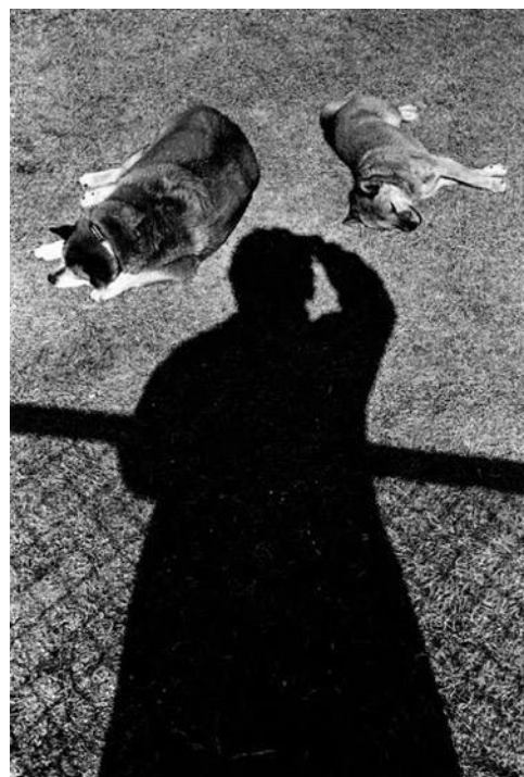
Daido Moriyama – Self-portrait with dogs, 1997