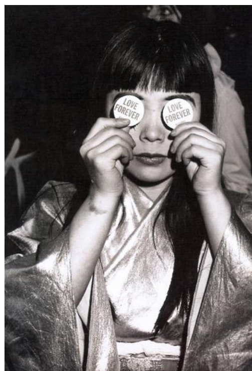
Yayoi Kusama - Self-portrait, 1966