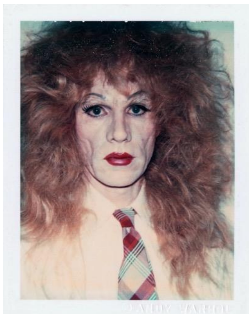
Andy Warhol - Self-portrait in drag, 1981

Artists and photographers have always enjoyed playing with the image of themselves, experimenting with costumes, make-up, poses and lighting to transform themselves into a wide range of characters. Look at the examples below and research those you find interesting. Attempt your own experiments with the Disguised Selfie. Could you change your gender, become a character from a favourite film, turn your back to the camera or become a famous work of art?