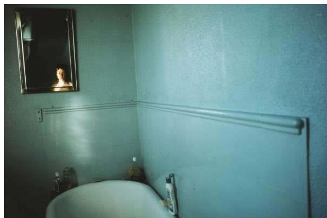
Nan Goldin - Self Portrait in Blue Bathroom, London 1980