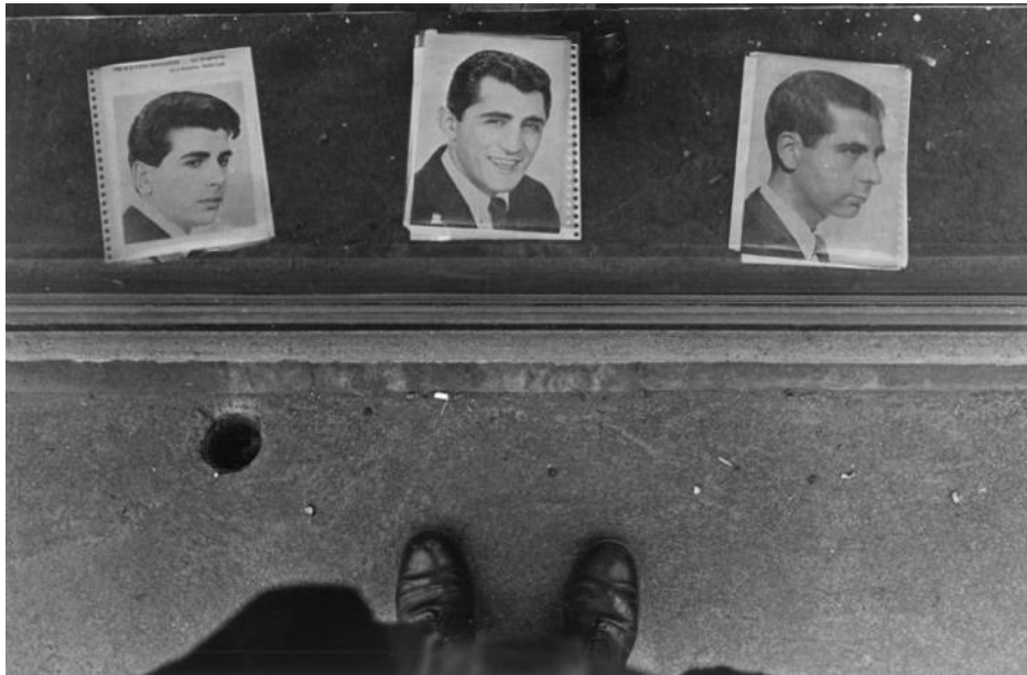
Lee Friedlander - Albany, 1967

Most Selfies concentrate on the face but why can't a Selfie represent another part of the anatomy? Take a look at these unusual self-portraits and experiment with your own Feet Selfies. You could use your feet and someone else's head. Or, if you're really clever, you could try to get a foreshortened version of your own face and feet into the same photo, like Harry Callahan.