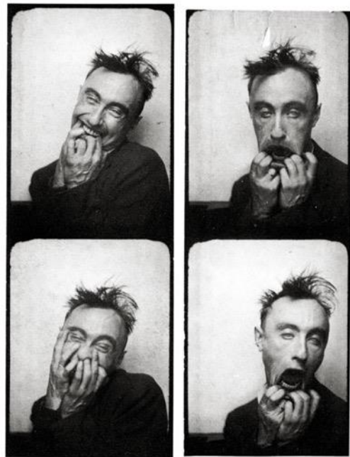
Yves Tanguy - Photomaton, Paris, 1928.