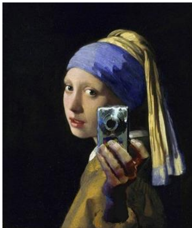
Vermeer's 'Girl with a Pearl Earring' takes a Selfie