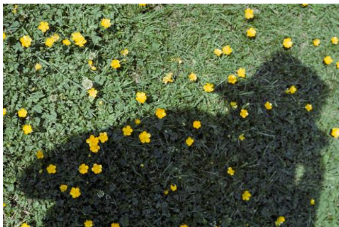
Vivian Maier, 1975

A shadow is like a photograph of ourselves, an image made by light (and the absence of it). Photographers are particularly sensitive to effects of light and so have long been interested in their own shadows. Experiment with your own Shadow Selfies, exploring a variety of effects and compositions.