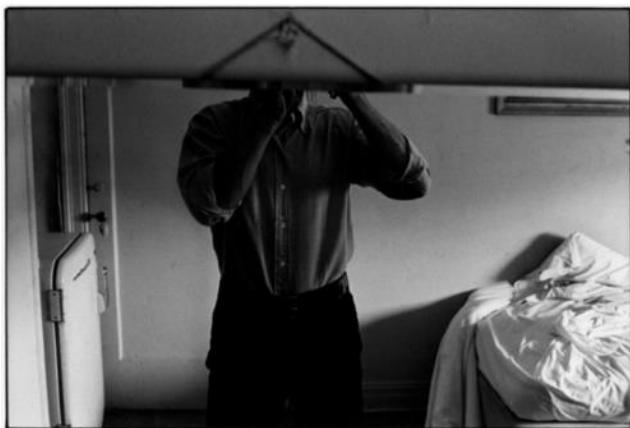
William Gedney - Self-portrait with head obscured, 1969

Associated with the Disguised Selfie, there are several examples of photographic Selfies in which the subject's face is obscured. The camera flattens three-dimensional space so that something in the foreground can appear to be on the same level as something else in the background. Of course, some of the obscuring can be done after the fact. Look at these examples and then experiment with making your own Obscured Selfies.