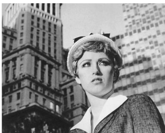
Cindy Sherman - Untitled Film Still #14, 1978